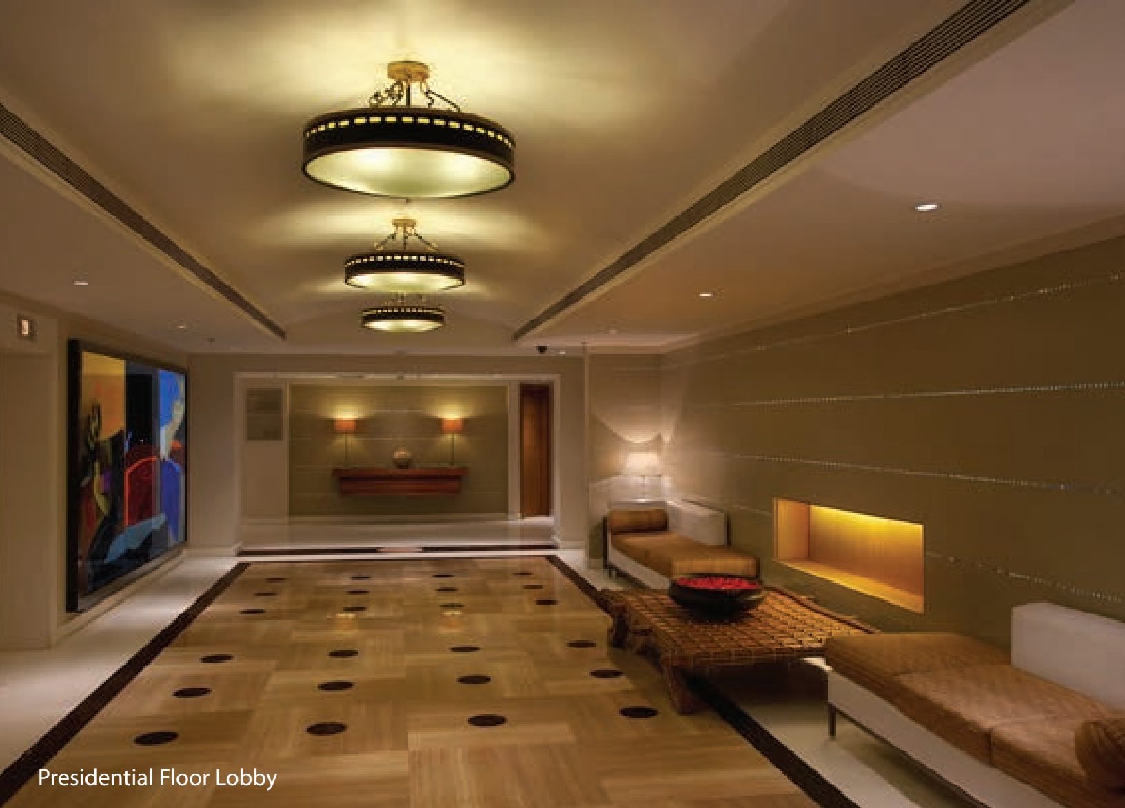
Presidential Floor Lobby