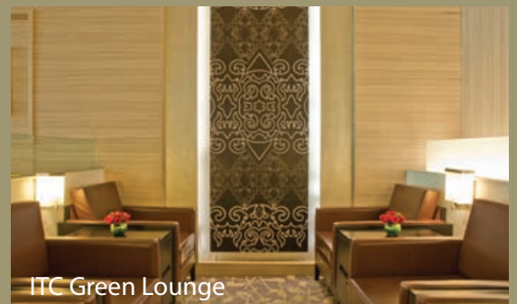
ITC Green Lounge