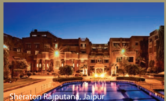
Sheraton Rajputana, Jaipur