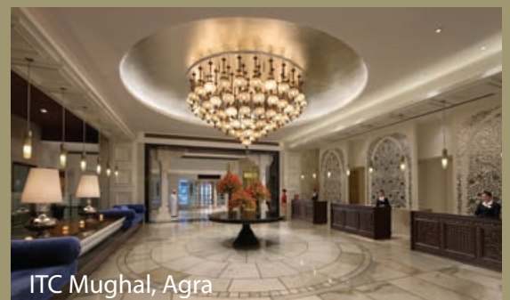
ITC Mughal, Agra