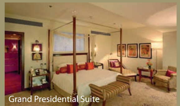
Grand Presidential Suite