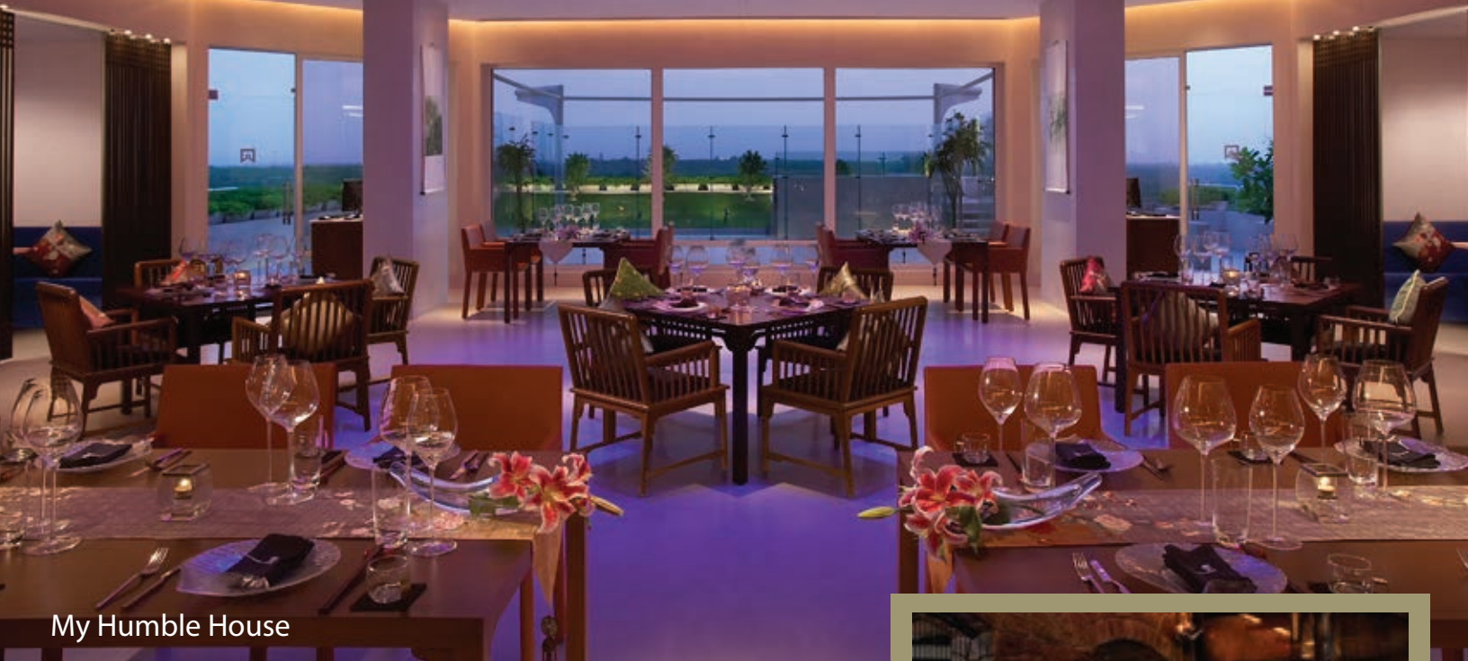
My Humble House