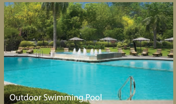
Outdoor Swimming Pool