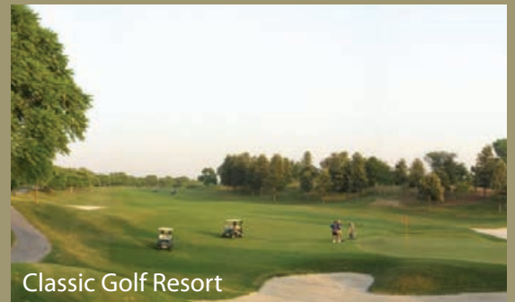
Classic Golf Resort

Take in the exuberance of the 'Pink City' of Jaipur known for its' historical forts, palaces and bustling bazaars. While at Jaipur, stay at the Sheraton Rajputana Hotel, just 0.5 km from the city center. Soak in the rich culture and royalty of Jaipur, reflected in the Hotel's regal design.