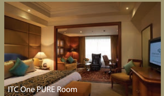
ITC One PURE Room