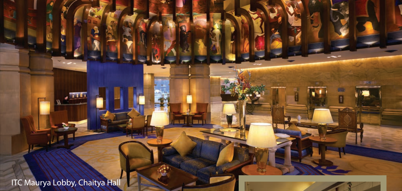
ITC Maurya Lobby, Chaitya Hall