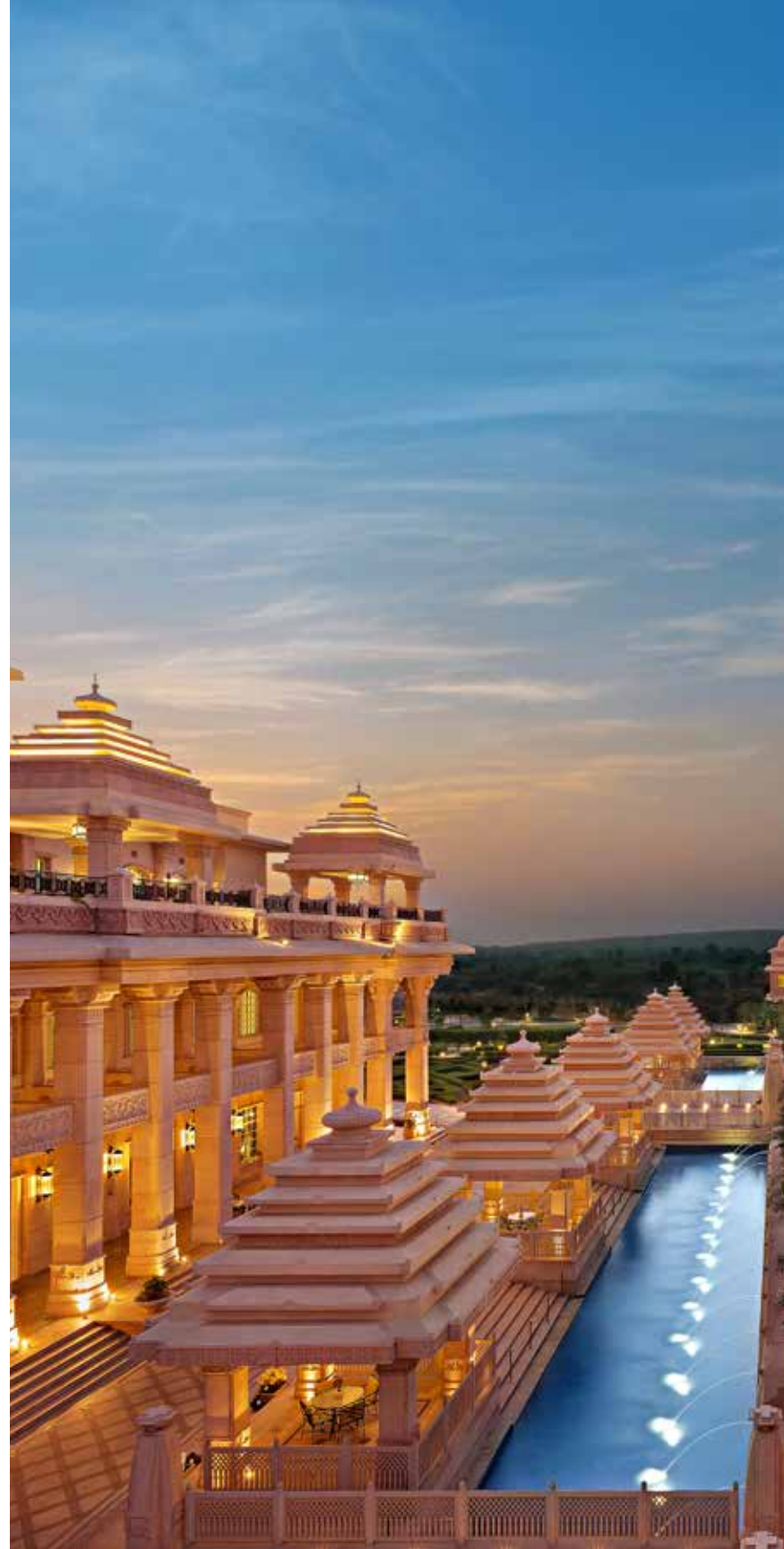
Table D'Hote menu. Experience unhurried luxury at its best as you watch the sun set over the horizon exclusively at ITC Grand Bharat.

Share a romantic candlelit dinner by the Ghats of Yamuna in your very own private gazebo. Celebrate memorable moments of togetherness with a four course